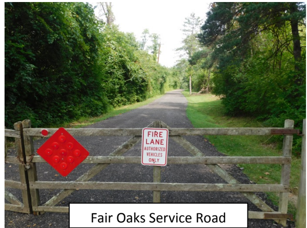
Fair Oaks Service Road

The utilization of the old Aracoma road grindings on these one lane access drives gives the Village’s emergency response vehicles a more dependable surface for the fire trucks and police vehicles to use when responding to an emergency. While the grinded material will not perform exactly like an application of new pavement intended for high volume vehicle traffic, it will serve in good form on the service drives which are kept closed by a gate and meant for emergency access situations.